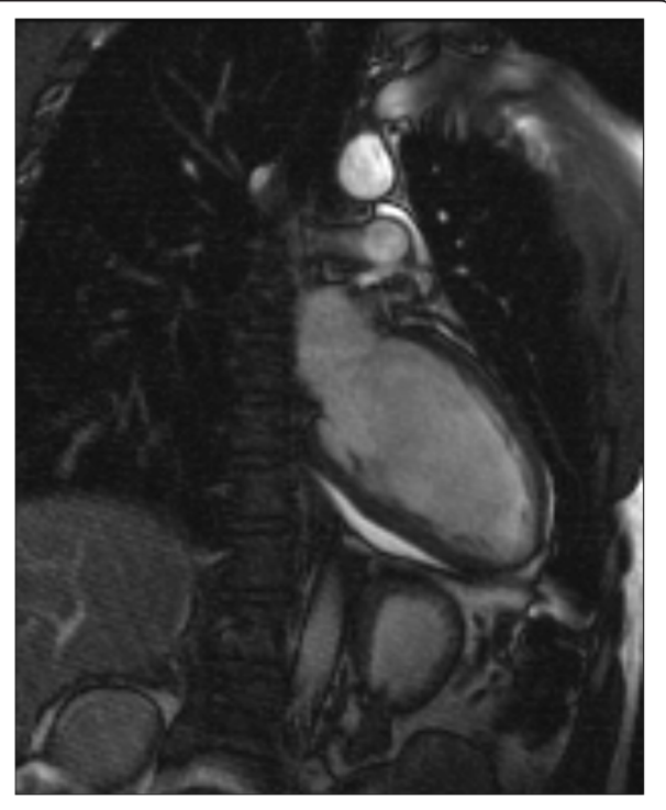
Fig. 2 Cardiac MRT before initiation of treatment